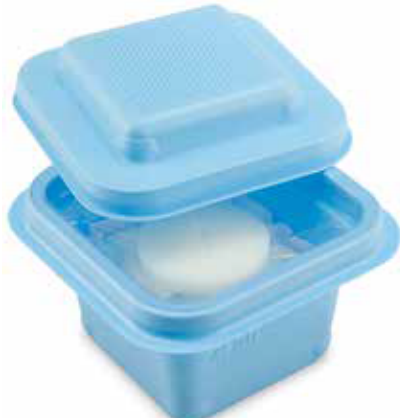
MiniStop™ Disposal Basin, 100ml fluid capacity and absorbent material. Includes particulate-free die cut sponge and seal-tight lid.