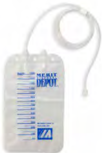
Merit Disposal Depot™ 1400 mL bag, 72" (183 cm) tubing, fixed male luer