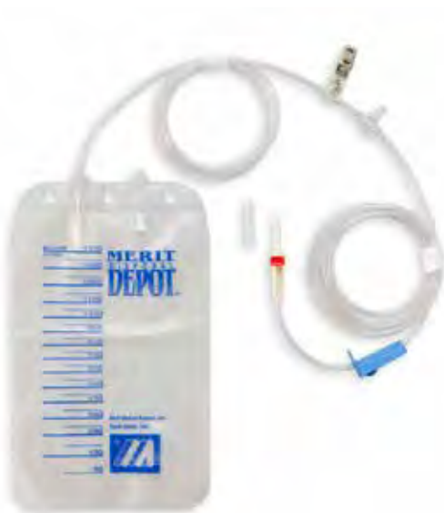
Merit Disposal Depot 1400 mL bag, check relief valve to vented spike, female control port, valve to bag: 48" (122 cm), valve to spike/drip: 72" (183 cm)