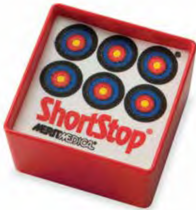
ShortStop™ Temporary Sharps Holder