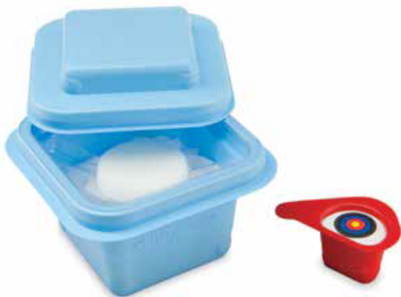
MiniStop+™ Disposal Basin with temporary sharps holder, 100ml fluid capacity and absorbent material. Includes particulate-free die cut sponge and seal-tight lid.