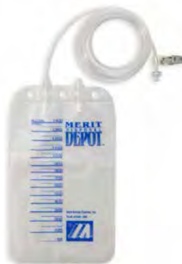
Merit Disposal Depot 1400 mL bag, 72" (183cm) tubing, one-way check valve with female luer