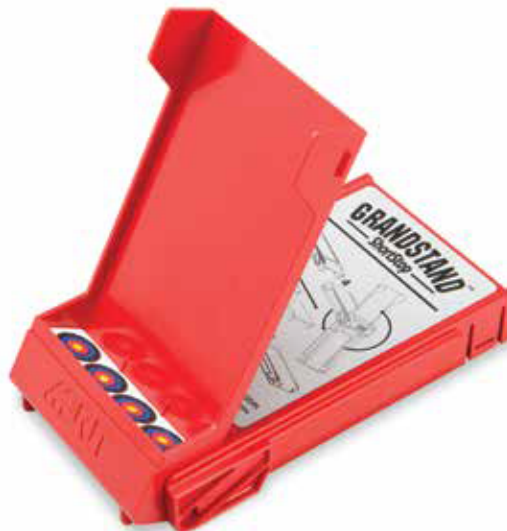
ShortStop Grandstand™ Temporary Sharps Holder with Upright Access