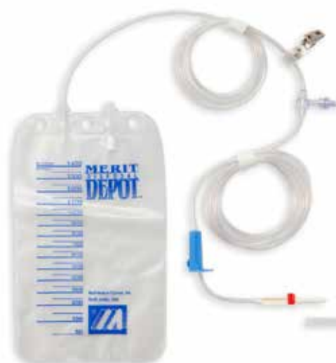
Merit Disposal Depot 1400 mL bag, check relief valve to vented spike, female control port with reflux valve, Valve to bag: 48" (122 cm), valve to spike/drip: 72" (183 cm)