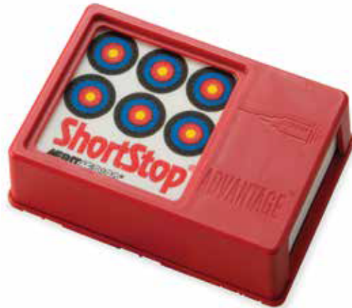
ShortStop Advantage™ Temporary Sharps Holder with Side Access Point